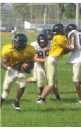
Lions, Eagles face off 11