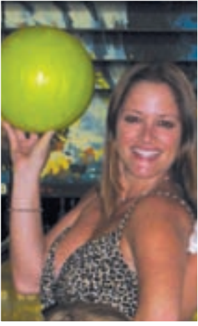
Bowling bash 4