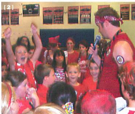
[ 2 ] members of the first grade class at Grandview